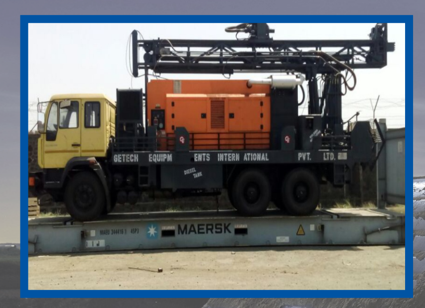
Project 2: Movement of Drilling Rig from Mumbai to Aqaba, Jordan