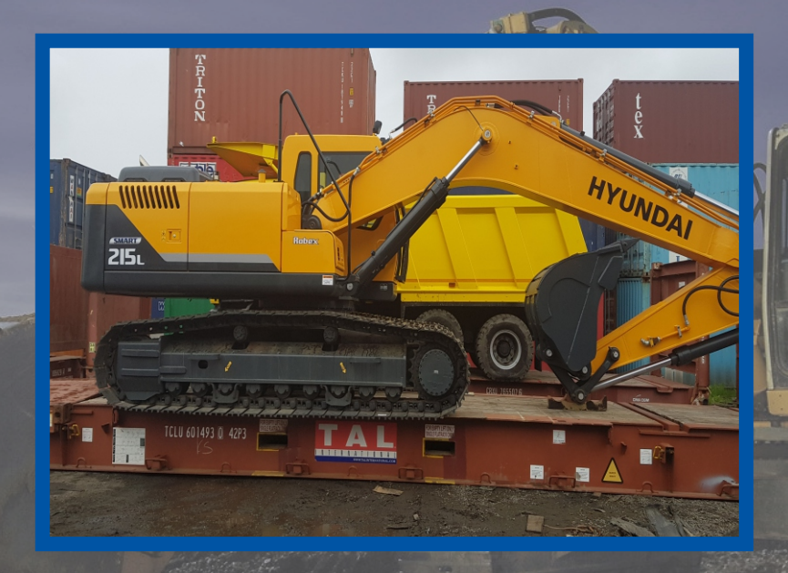
Project 3: Movement of Excavator from Mumbai to Beira, Mozambique.