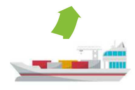
Port of Loading